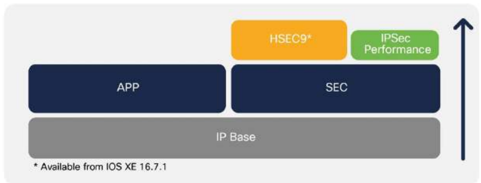
Figure 2. Available technology licenses

A single Cisco IOS XE Universal image encompassing all functions is delivered with the platform. Advanced features can be enabled simply by activating a software license on the Universal image. Technology packages and feature licenses, enabled through right-to-use licenses, simplify software delivery and decrease the operational costs of deploying new features.