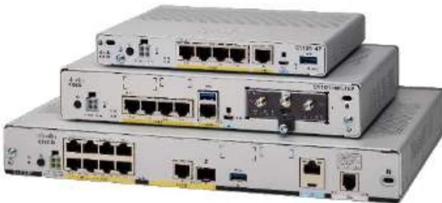
Figure 1. Cisco 1000 Series Product Family

Note: Not all 1000 series SKU variants are available in every region with different technologies (check on CCW pricelist for your region).